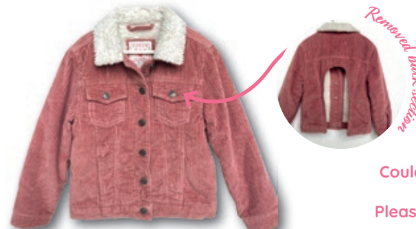
Removed back section

Removing the back section means a comfier fit whilst sitting.