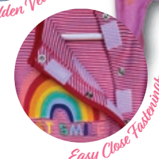
Easy Close Fastenings

By adding Velcro to this wheelchair bound child's top, dressing has been made easier.