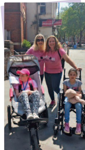
Above: Members of Mums on a Mission at Walk A Mile.