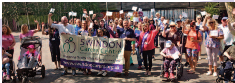
Left: Celebrating Walk A Mile.