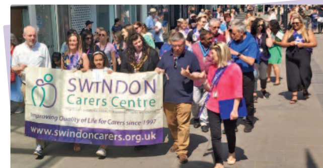
Above: Walk A Mile in Swindon town centre.