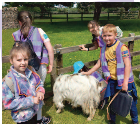
At Cotswold Wildlife Park.

During the May half-term our young carers enjoyed a trip to Cotswold Wildlife Park where they had fun in the adventure playground, met the animals and tucked into a picnic. They also enjoyed a trip to the cinema and a theatre trip to watch The Lion King at the Bristol Hippodrome!