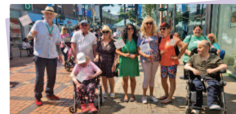
Right: Walk A Mile completed!